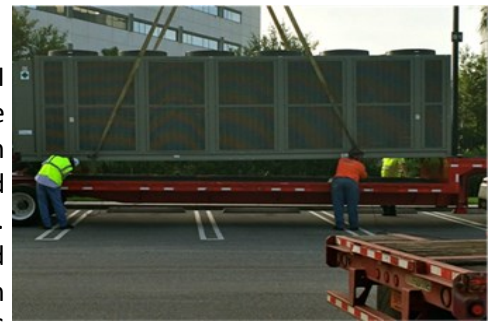
Figure 2: Partnership II air-cooled chillers arriving and being crane-lifted to the rooftop

UES began HVAC renovations at Partnerships I and II in early 2014. As HVAC systems consume more than 50% of a building's energy, two high efficiency Trane Stealth 600-ton, air-cooled chillers were chosen for Partnerships I and II. The chiller replacements were accomplished over a 48-hour period on two weekends in June. Upon successful installation, UES designed, programmed, and installed new building automation control systems with