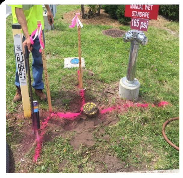
Figure 3: a natural gas valve that was previously buried and brought back to grade. The service lines are then located for campus map updates.